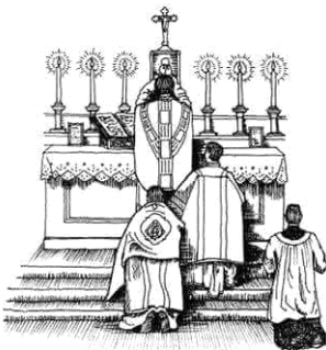
Missa Solemnis SOLEMN HIGH MASS

There are different ways of celebrating the Mass, which differ mainly in the elaborateness of the ceremonies used. If you are new to the Latin Mass, Low Mass is often the best choice, as the music of High Mass can make it difficult to discern the cues that can tell you what is happening on the altar.