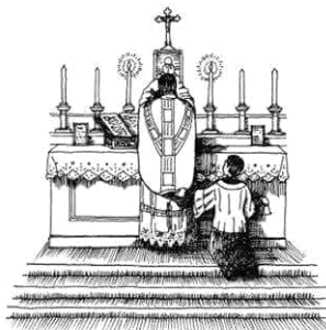
Missa Privata LOW MASS