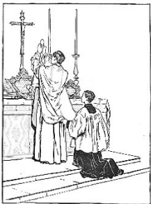
Elevation of Host