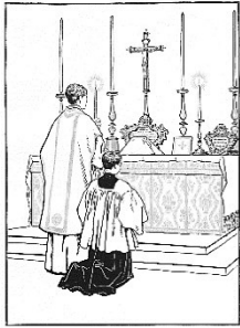
Prayers at the foot of the altar