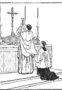
Elevation of Chalice