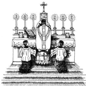
Missa Cantata HIGH MASS